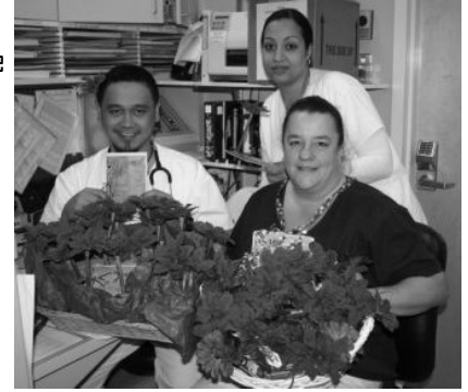
Brookhaven Hospital Staff receiving the note pads and poinsettia pens.

By giving back to their community, we hope the students will learn that it's important to be thankful for what we have no matter how much or how little and to think of others who may have an unfortunate situation to deal with.