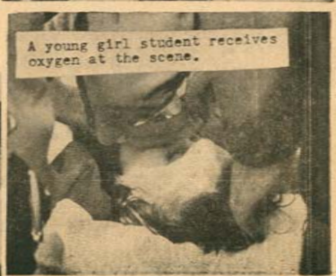
A young girl student receives oxygen at the scene.