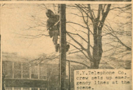
N.Y. Telephone Co. crew sets up emergency lines at the scene.