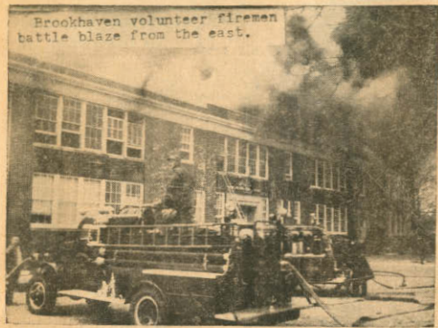
Brookhaven volunteer firemen battle blaze from the east.