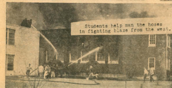
Students help man the hoses in fighting blaze from the west.