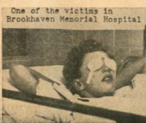
One of the victims in Brookhaven Memorial Hospital