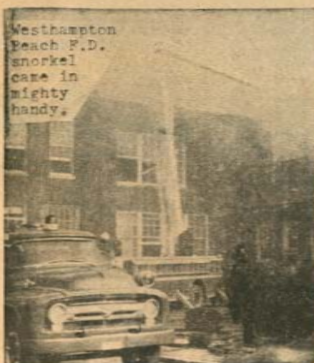
Westhampton Beach F.D. snorkel came in mighty handy.

At 1:50 P.M. last Friday, ten minutes before the close of classes, a flash fire believed caused by old electrical wiring, broke out in the ceiling of the old auditorium of the Bellport Jr. High School, on Station Road.